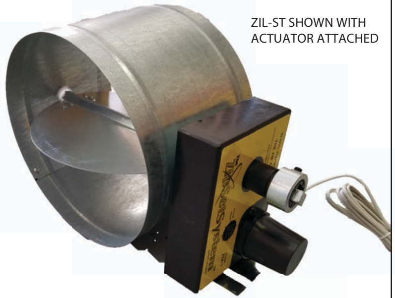
ZIL-ST SHOWN WITH ACTUATOR ATTACHED