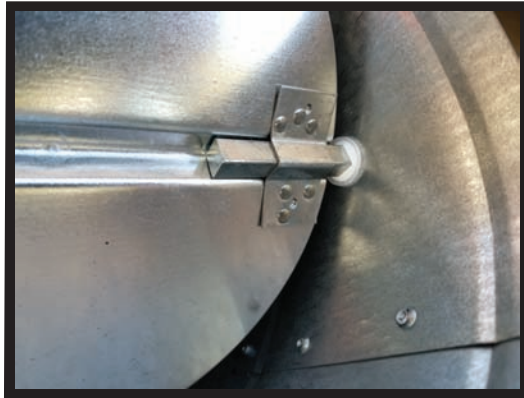
HEAVY DUTY CONSTRUCTION